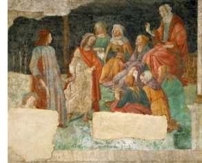
Young Man Being Introduced to the Seven Liberal Arts, by Sandro Botticelli

This course is offered only to Australian-based participants with a 30-person attendance cap, so register early. Proceeds for this conference go directly to help ACES.